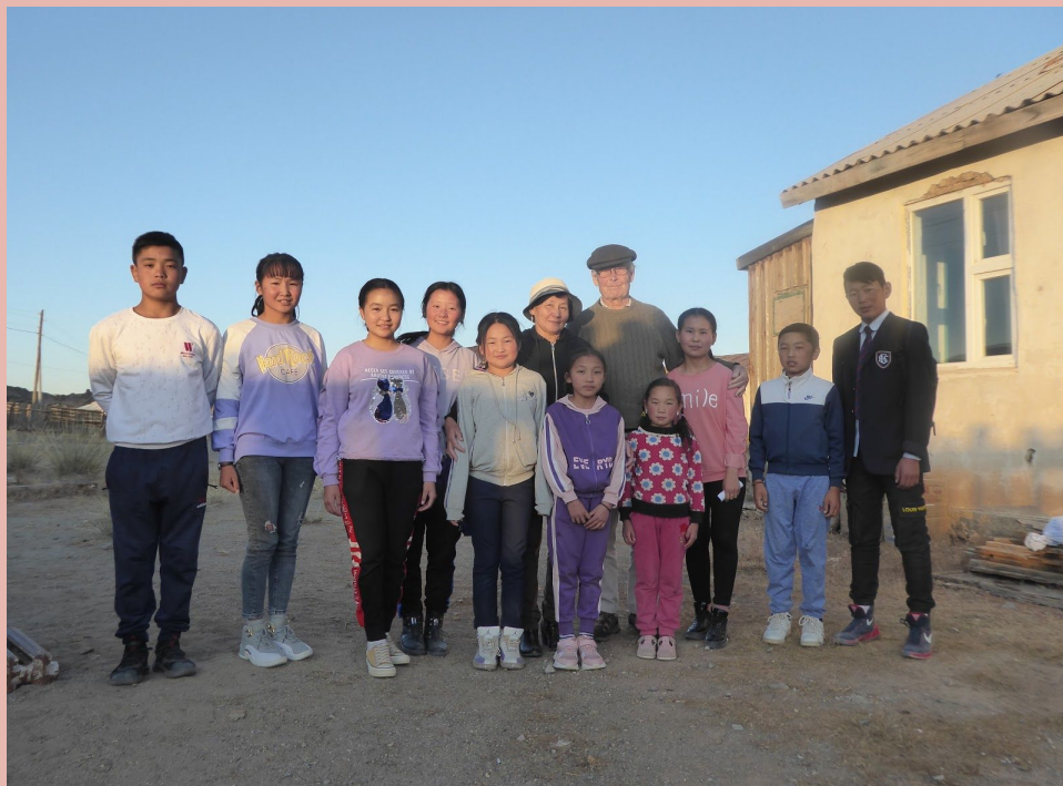
A photo of the Environmental Club near Tol Bulag

This is a photo of an environmental group called the Umbrella Club that is from a village near a place called Toli Bulag in Mongolia. The group aims to protect the wild camel and all the other species in the Gobi Desert in Mongolia.